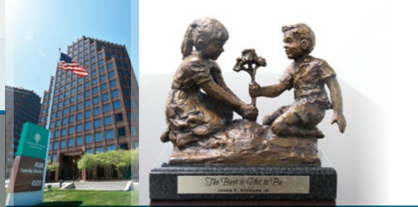
ACI's logo is the oak tree which is symbolic of continued growth and stability. To honor our partnership, ACI presented Nomura with the bronze statue pictured above.

On May 19, 2016, Nomura Holdings acquired a non-controlling approx. 41% economic interest (voting rights of 10.1%) in American Century Investments (ACI), an independent investment management firm in the U.S. Looking ahead, Nomura and ACI intend to work together as strategic partners.