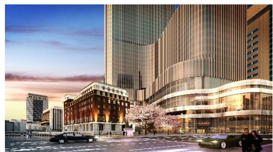
Rendering of lower levels, exterior, from Chuo-dori Street (evening)