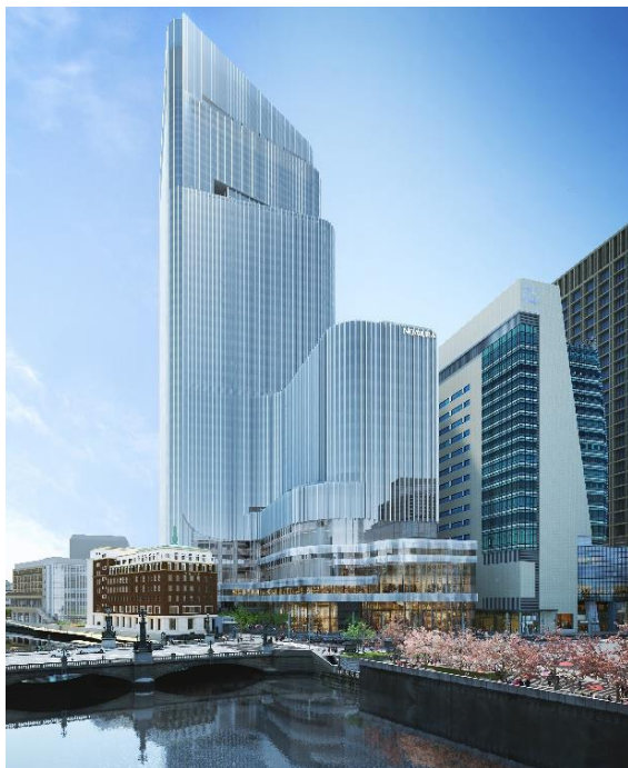
Rendering of exterior