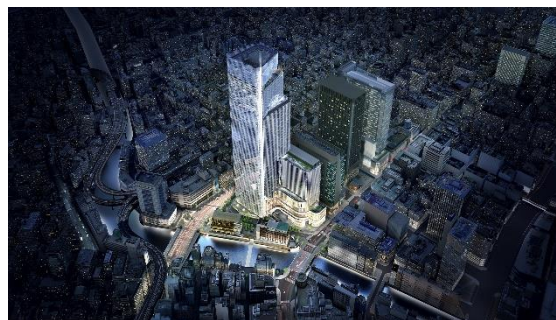
Rendering of aerial view at night