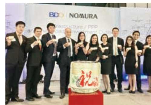
Party commemorating start of general operations on October 24, 2016

In 2016, Nomura and Banco de Oro Unibank, Inc. (BDO Unibank), the Philippines, largest commercial bank, established BDO Nomura Securities, Inc. (BDO Nomura), an online securities company and a means for Nomura to develop a Retail business in the Philippines. In October 2016, BDO Nomura commenced operations targeting major domestic clients of BDO Unibank. It also began transacting with local Philippine stock exchanges to fill orders received from Nomura's global clientele.