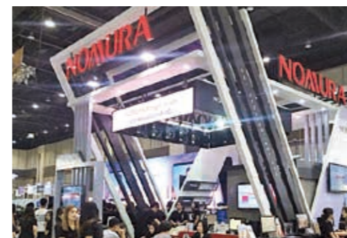
CNS booth at an event for individual investors sponsored by the Stock Exchange of Thailand

Capital Nomura Securities Public Company Ltd. (CNS) is a securities company based in Bangkok, Thailand, that engages in both Retail and Wholesale businesses. It was established in May 1970, became a founding member of the Stock Exchange of Thailand in 1975, and was then listed on the exchange in 1988.