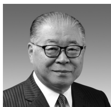
Chairman of the Audit Committee

Outside Director, Independent Director Reappointment