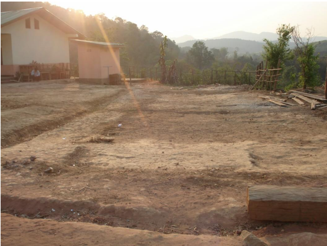
Preparations begin at the site of the new school