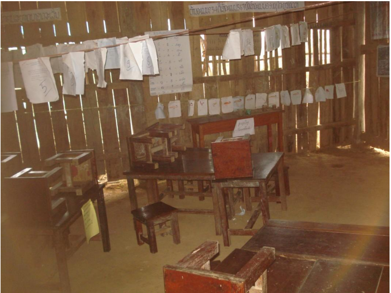
An existing classroom