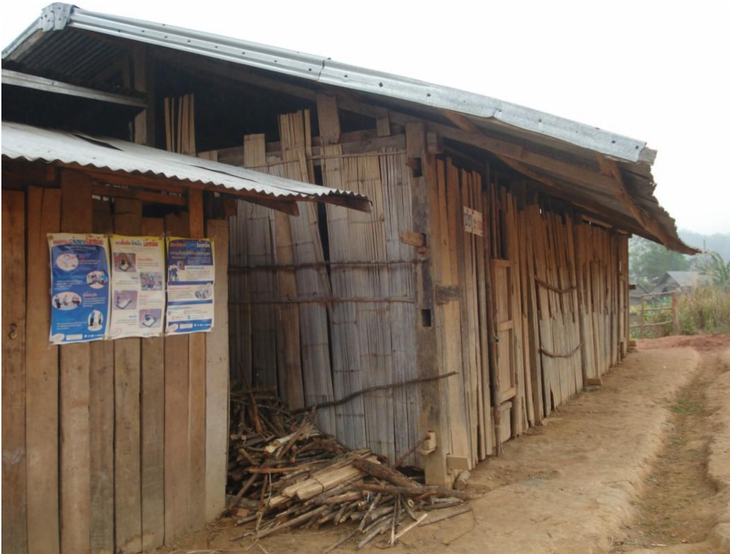
The dilapidated school building